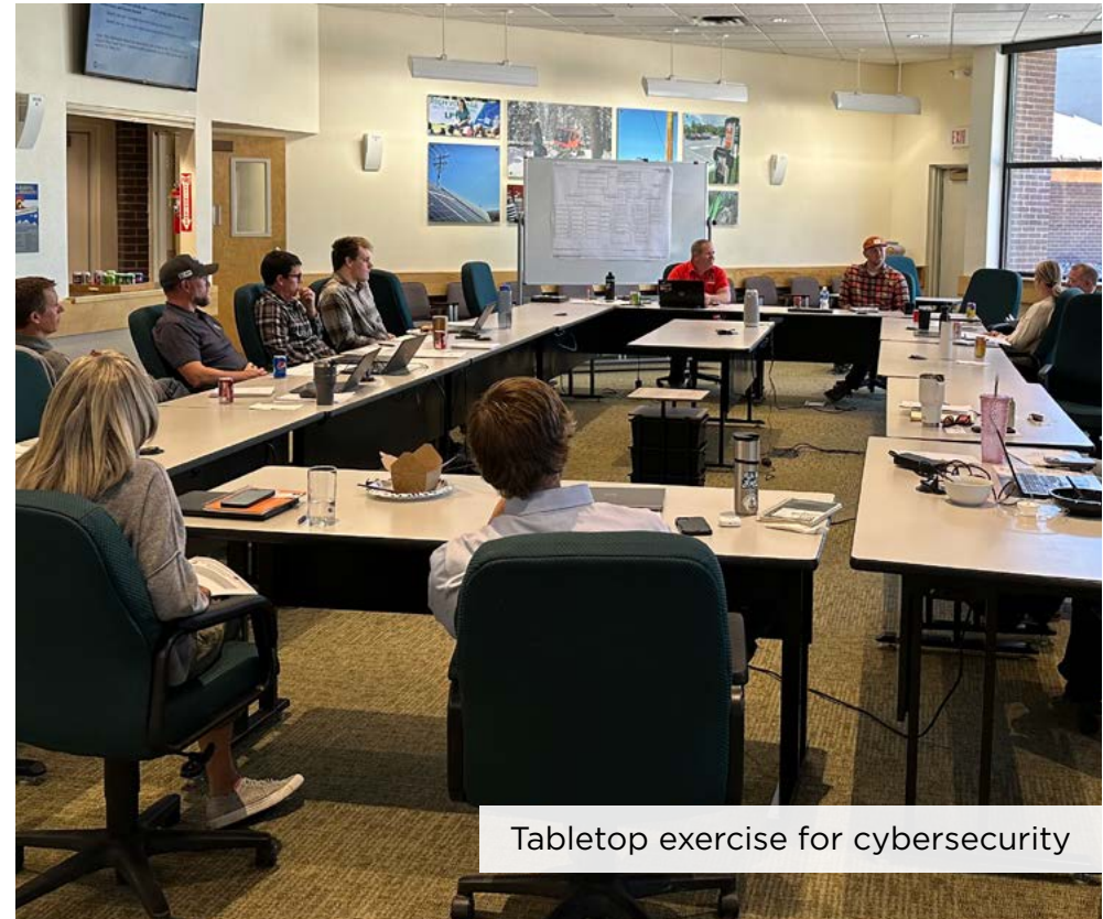
Tabletop exercise for cybersecurity