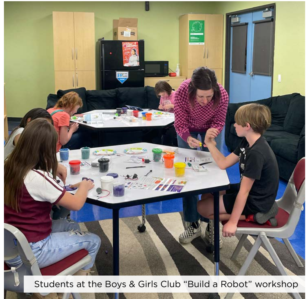
Students at the Boys & Girls Club “Build a Robot” workshop