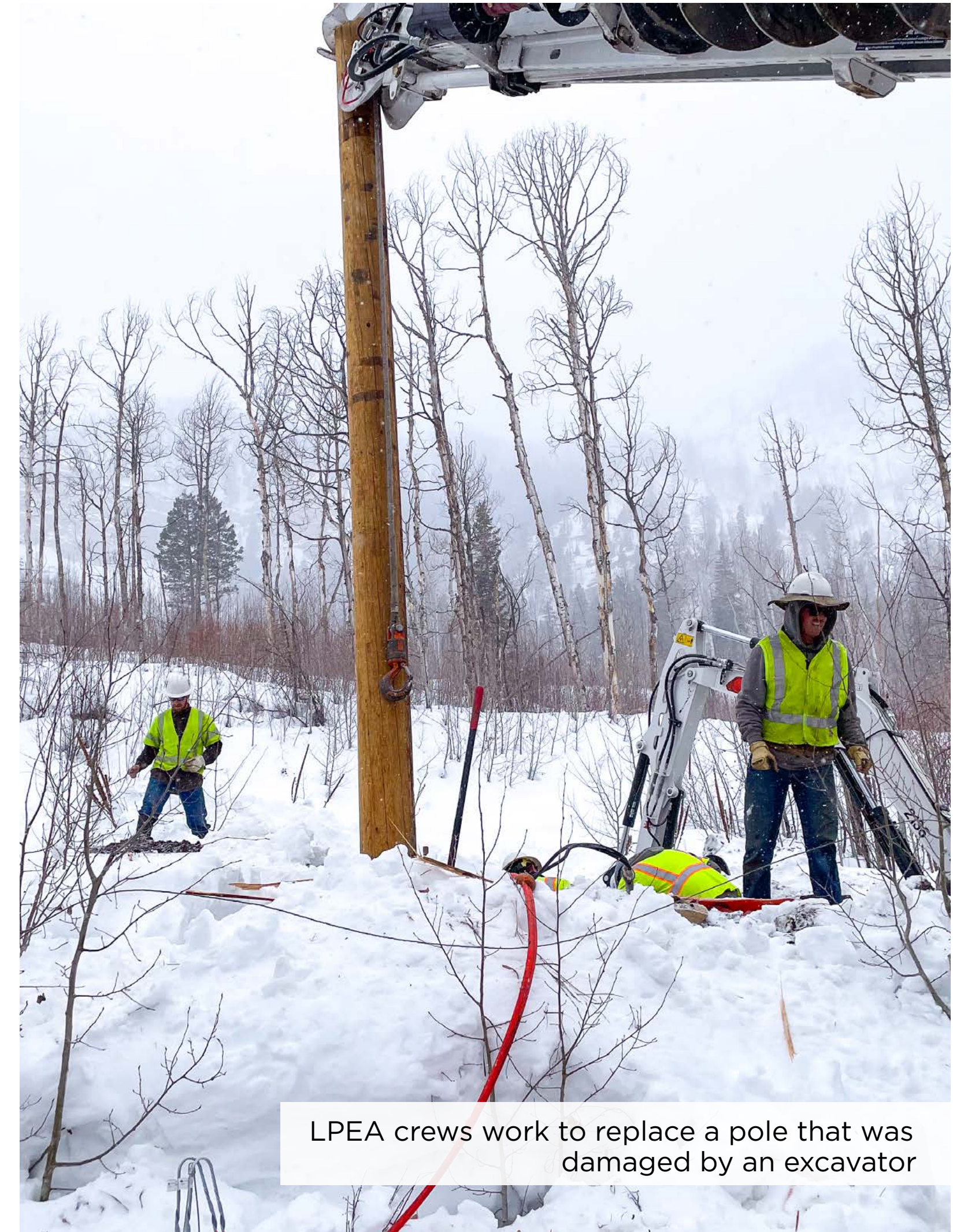
LPEA crews work to replace a pole that was damaged by an excavator