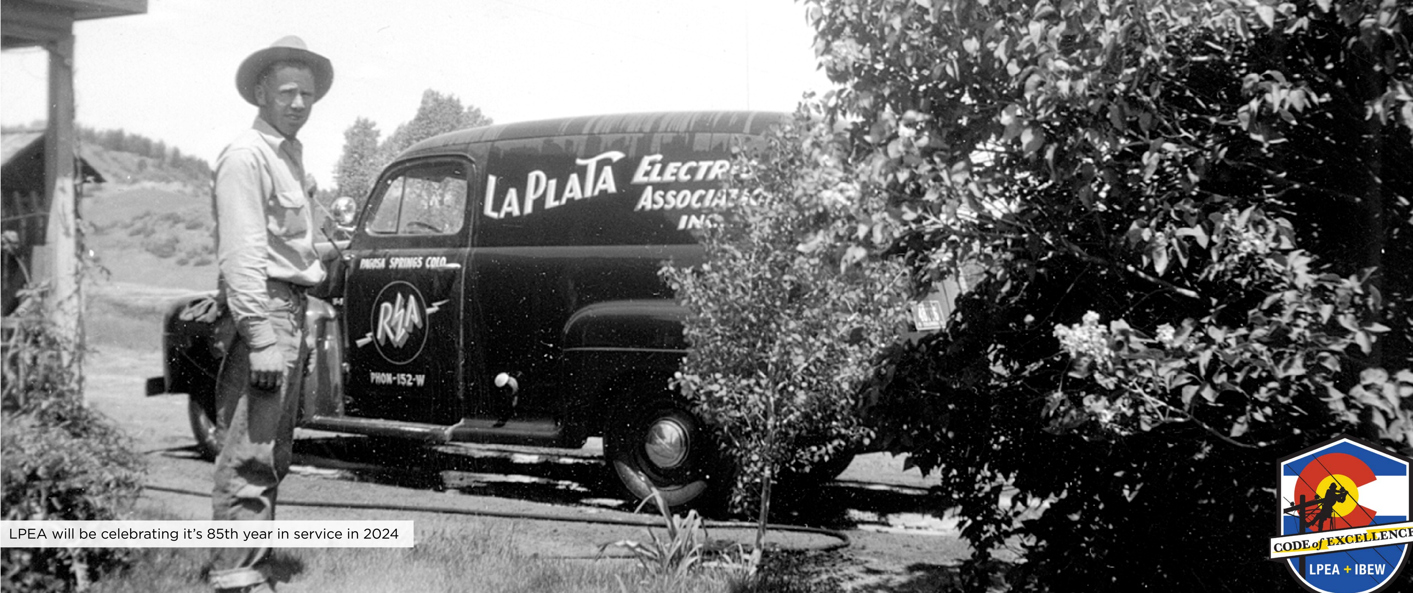
LPEA will be celebrating it's 85th year in service in 2024