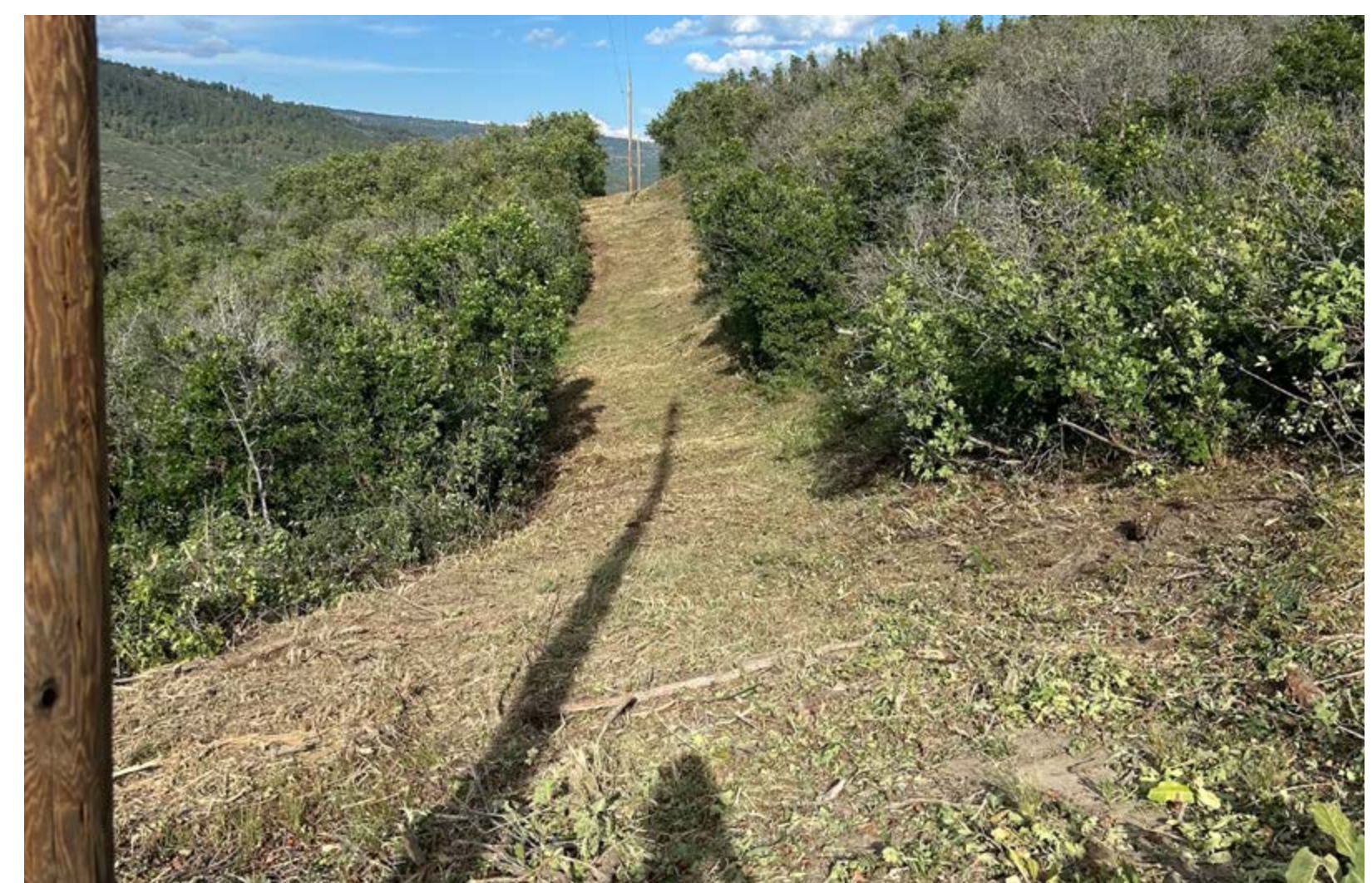
Vegetation clearing on the Bear Creek to Pine Springs Line.