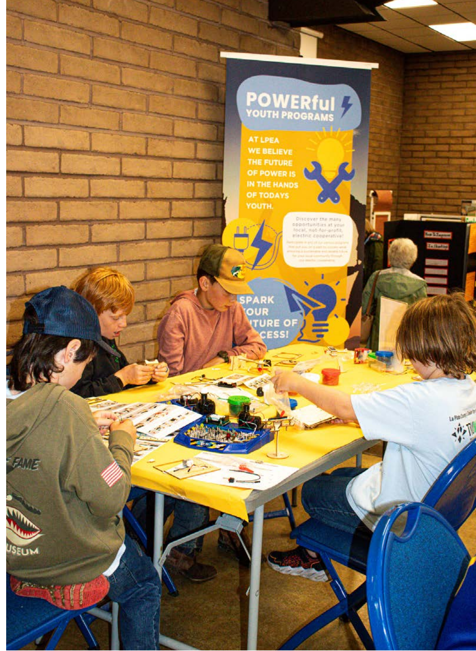
Youth engaged in more STEM activities this year at the La Plata County Fair, doubling the amount of participants from last year.