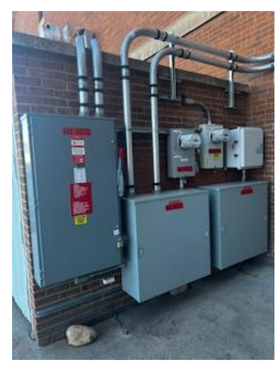
Labeled AC Disconnect