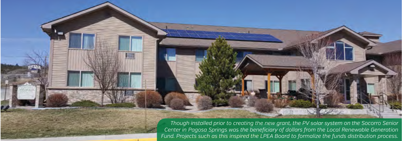
Though installed prior to creating the new grant, the PV solar system on the Socorro Senior Center in Pagosa Springs was the beneficiary of dollars from the Local Renewable Generation Fund. Projects such as this inspired the LPEA Board to formalize the funds distribution process.

In an effort to support area not-for-profit organizations and encourage new renewable electricity generation projects in its service territory, LPEA has established a Renewable Generation Funds Grants Program. Not-for-profit organizations that are current consumer-members in-good-standing, and based within LPEA's service territory, qualify to apply. Application deadline is Nov. 1, 2018.