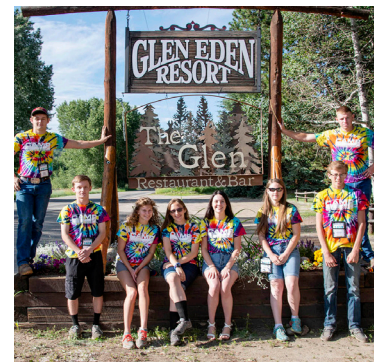
Colorado's future cooperative employees and leaders.