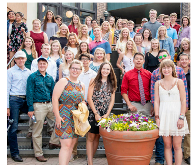
More than 90 high school students from Colorado, Kansas, Oklahoma and Wyoming attended the 2019 Cooperative Youth Leadership Camp in Steamboat Springs. LPEA will sponsor and send three students in 2020.