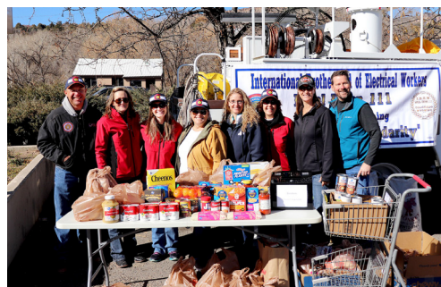
The International Brotherhood of Electrical Workers (Local IBEW 111 26 and 26A), of LPEA, will host the 12th Annual "Fill the Bucket" food drive, Saturday, Nov. 16, 2019, 8 a.m. to 2 p.m. at the City Market in Pagosa Springs (left), and South City Market in Durango (right).