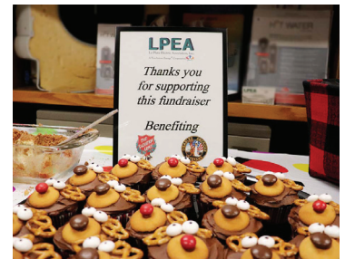
Save room for dessert! A wide array of homemade desserts will be available for an extra donation.